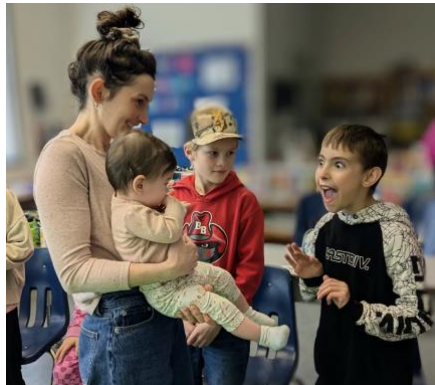
Grade 4 students working with Root of Empathy Program