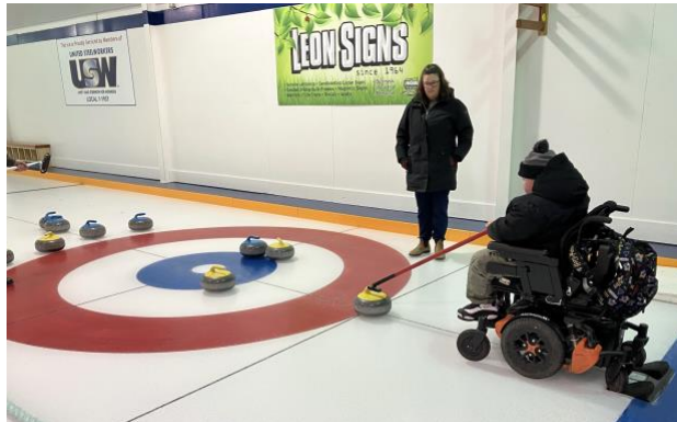
Grade 6 PHE class: Curling and utilizing our community resources