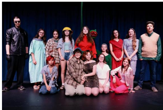
2025 Theatre Production of Little Shop Horrors

Although we have a small population of students in the grade 10-12 graduation program, we are still able to offer a vast array of electives and academic courses. We have students graduate from Lake Cowichan School each year, prepared for further learning in Academics, Trades, Arts, Athletics, and much more.