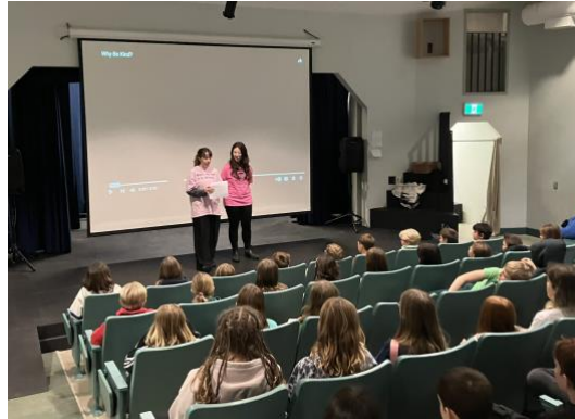
LCS' Leadership 11/12 Class leading Compassion Week to our Elementary students

We have a weekly Laker Card draw on Fridays to win donuts. This has been an ongoing tradition for years. Students actively seek opportunities to demonstrate leadership, responsibility, kindness, safety, showing pride in their school, determination, cooperation with others, and overall making our school a better place to be. This positive reinforcement helps to build empathy within a community of young learners.