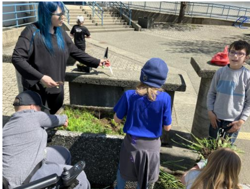
LCS Grade 4/5's Gardening Exploratory