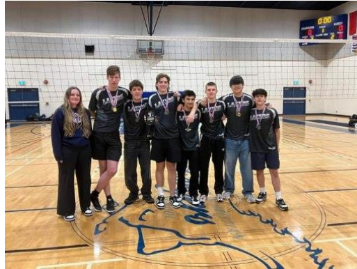
LCS Senior Boys Volleyball Team