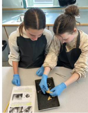
Science 8 class doing a dissection of a cow's eye

struggle with rising living costs and economic uncertainty. As a result, Lake Cowichan School has grown into a vital hub for addressing student and family needs. Our staff often provide support that extends beyond academics, helping connect learners with services, ensuring access to food and emotional care, and creating stability through trusted relationships. In doing so, the school plays an essential role in promoting equity and well-being across our community.